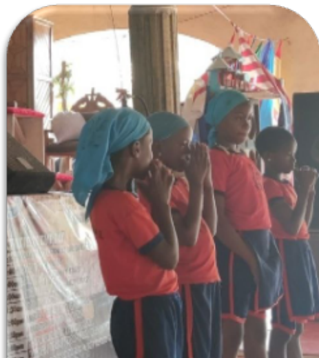
CHILDREN PRAYING FOR PEACE IN UKRAINE AND THE WORLD AT UGWU-NSO

Early in the morning on Ash Wednesday we use to go on our knees from the Holy Mountain to the Holy Trinity Cathedral in Orlu, where we attend morning mass and receive the ash. It is our tradition for many years. This emphasises the link between Holy Mountain and the Cathedral, Two Hearts of Love and Holy Trinity. Jesus and Mary, the Two Hearts of Love are the way to the Holy Trinity, the key to understand this great mystery of the Holy Trinity – Mary is the daughter of the Father, Spouse of the Holy Spirit and the Mother of the Son.