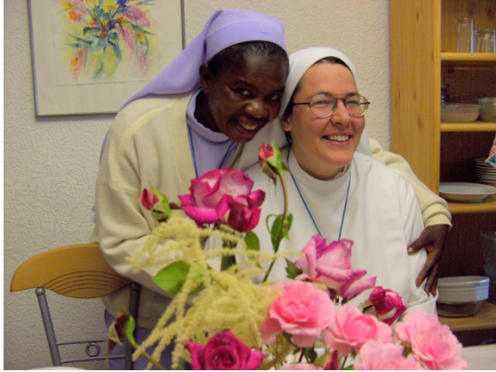
In the Centre in Essen, May 2011