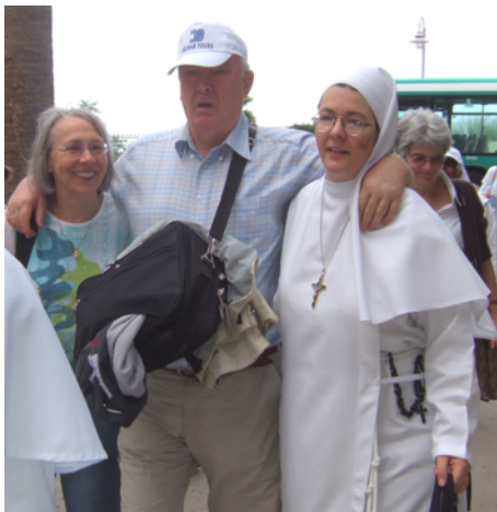
On the SHL-Pilgrimage to Israel, together with her parents, in 2009